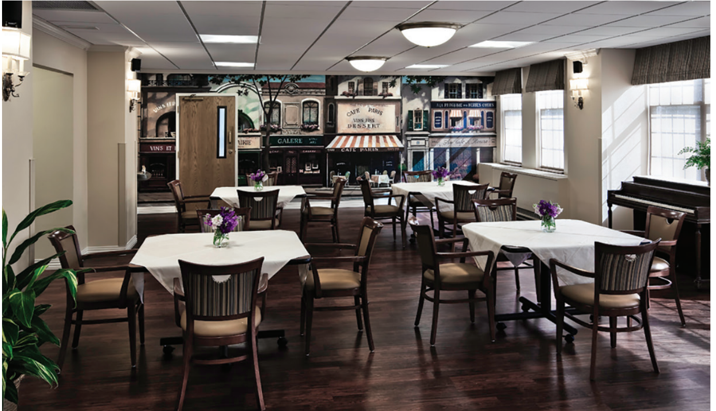
Smith Senior Living, Chicago, Illinois—dining room