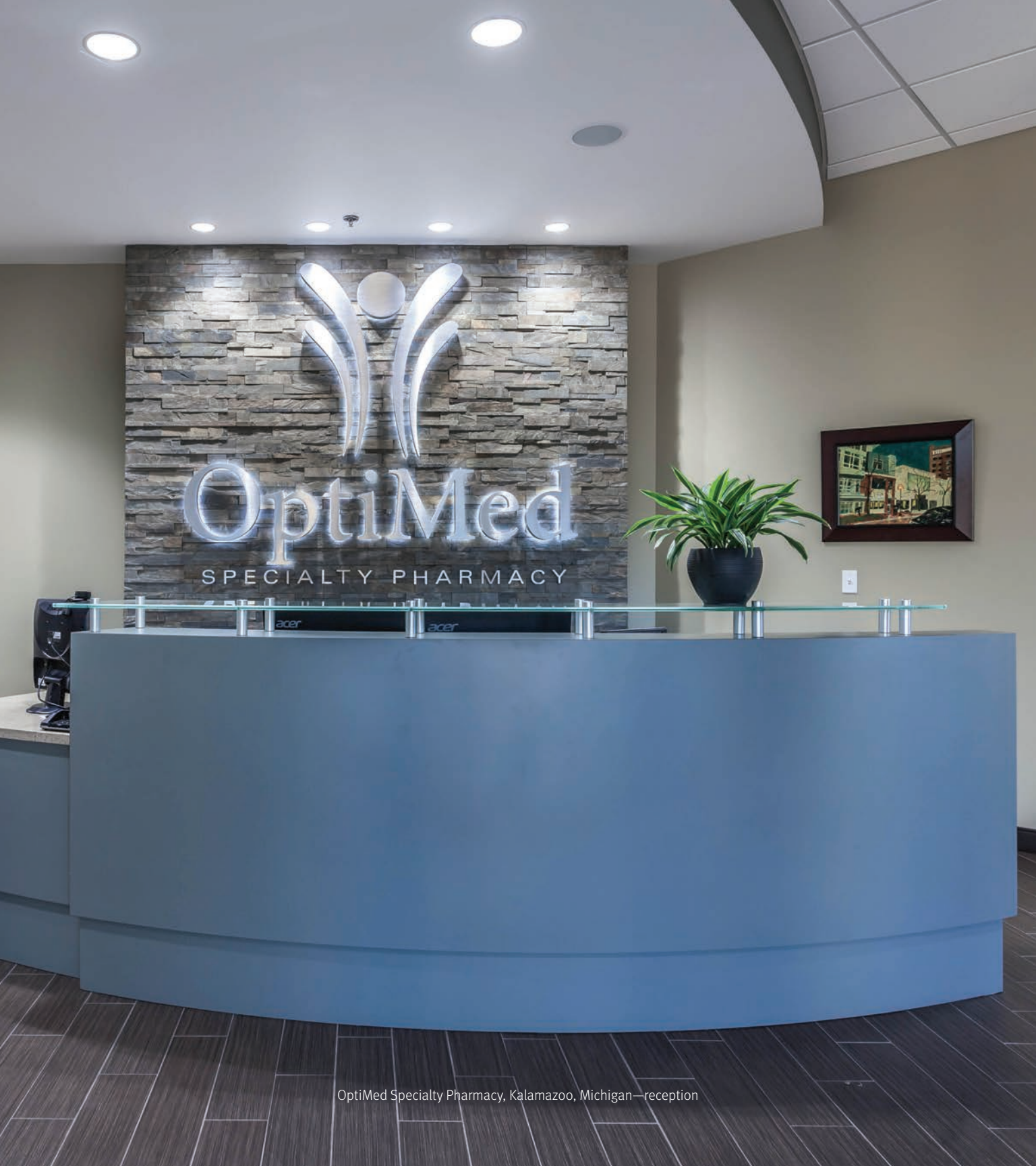
OptiMed Specialty Pharmacy, Kalamazoo, Michigan—reception