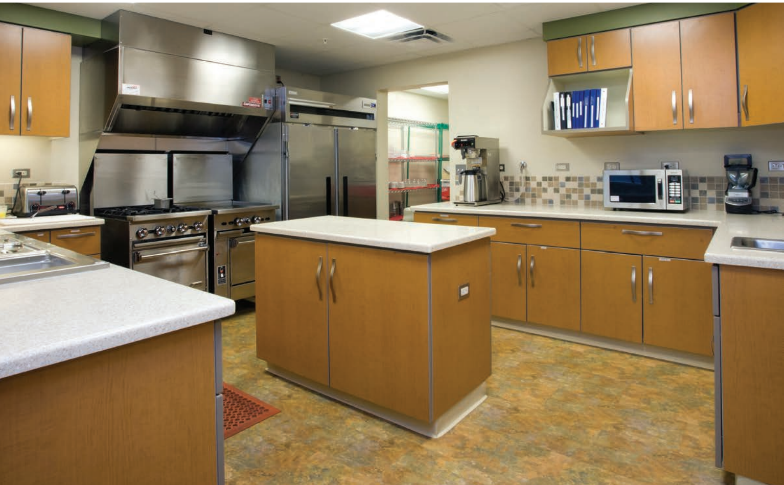
Lapeer County Medical Care Facility, Lapeer, Michigan—kitchen