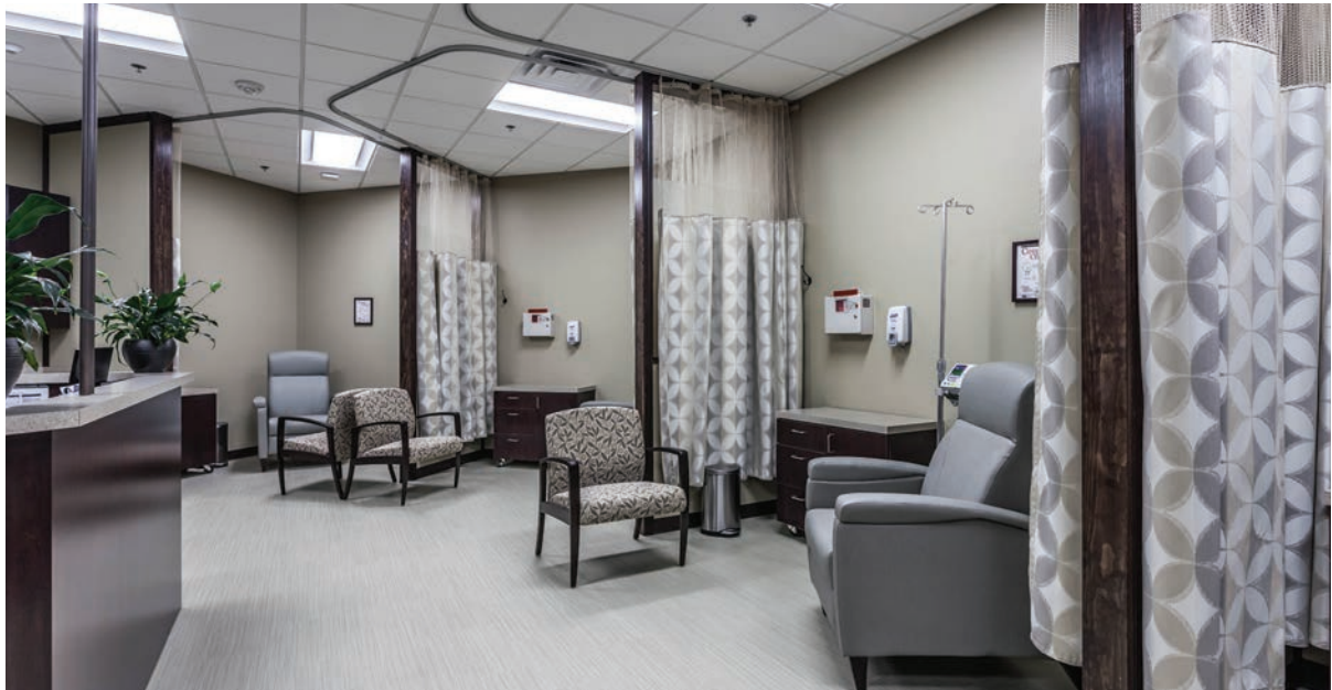
OptiMed Specialty Pharmacy, Kalamazoo, Michigan—infusion center