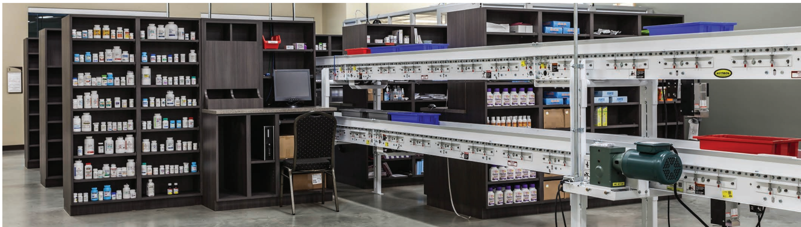
OptiMed Specialty Pharmacy, Kalamazoo, Michigan—dispensary