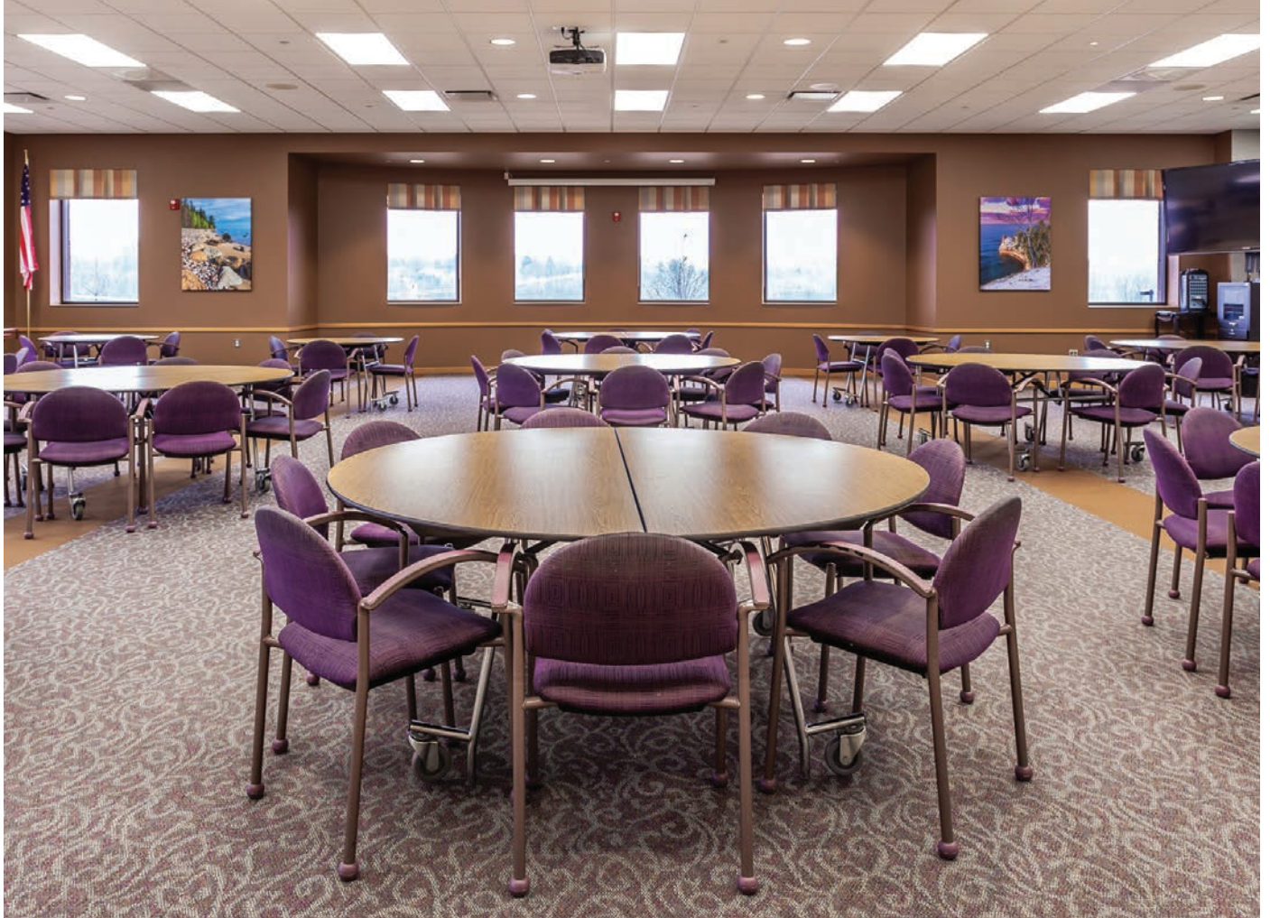
Older Persons' Commission, Rochester, Michigan—dining room