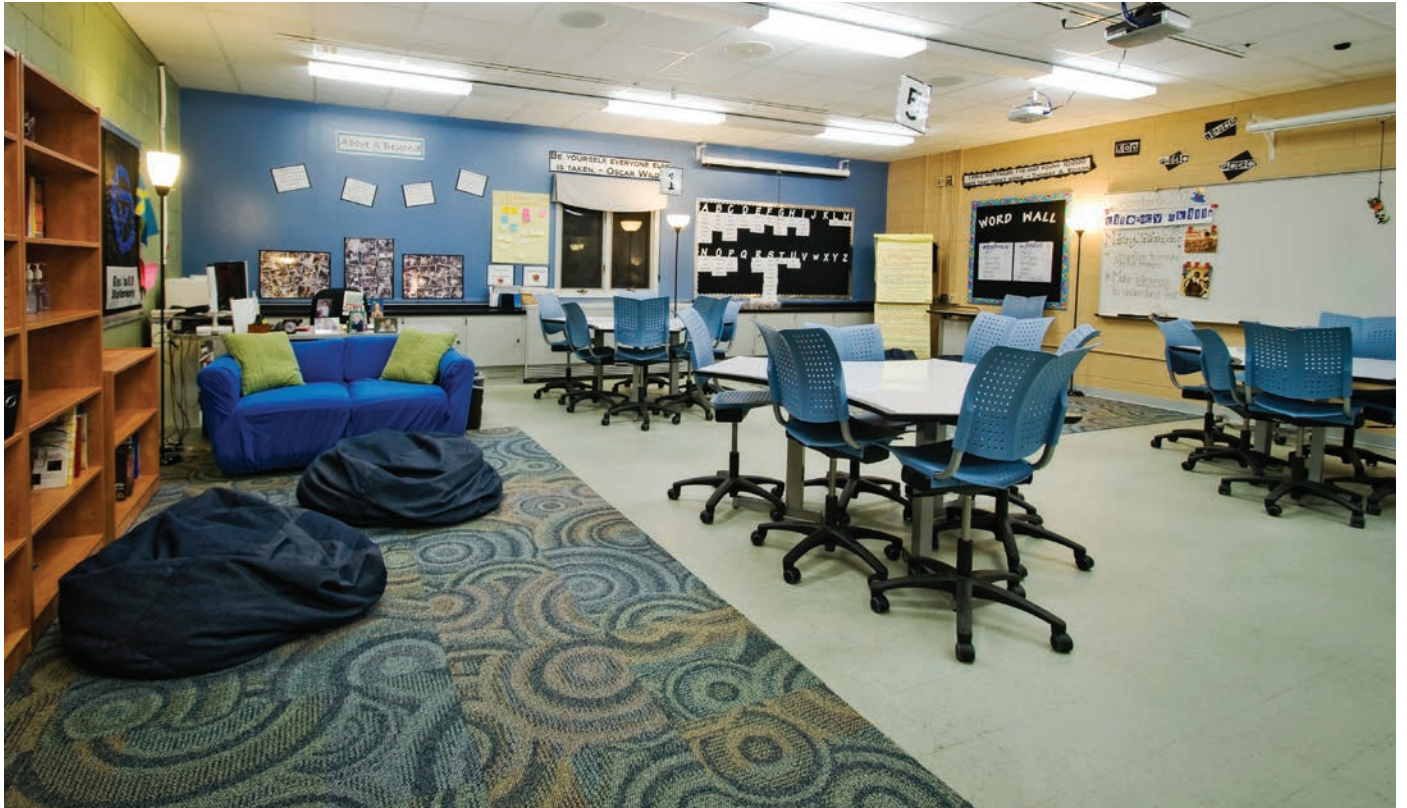
Spring Lake Middle School, Spring Lake, Michigan—classroom