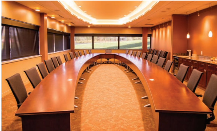
Left and above: HPS Office, Middleville, Michigan—lower level lounge, kitchen and boardroom