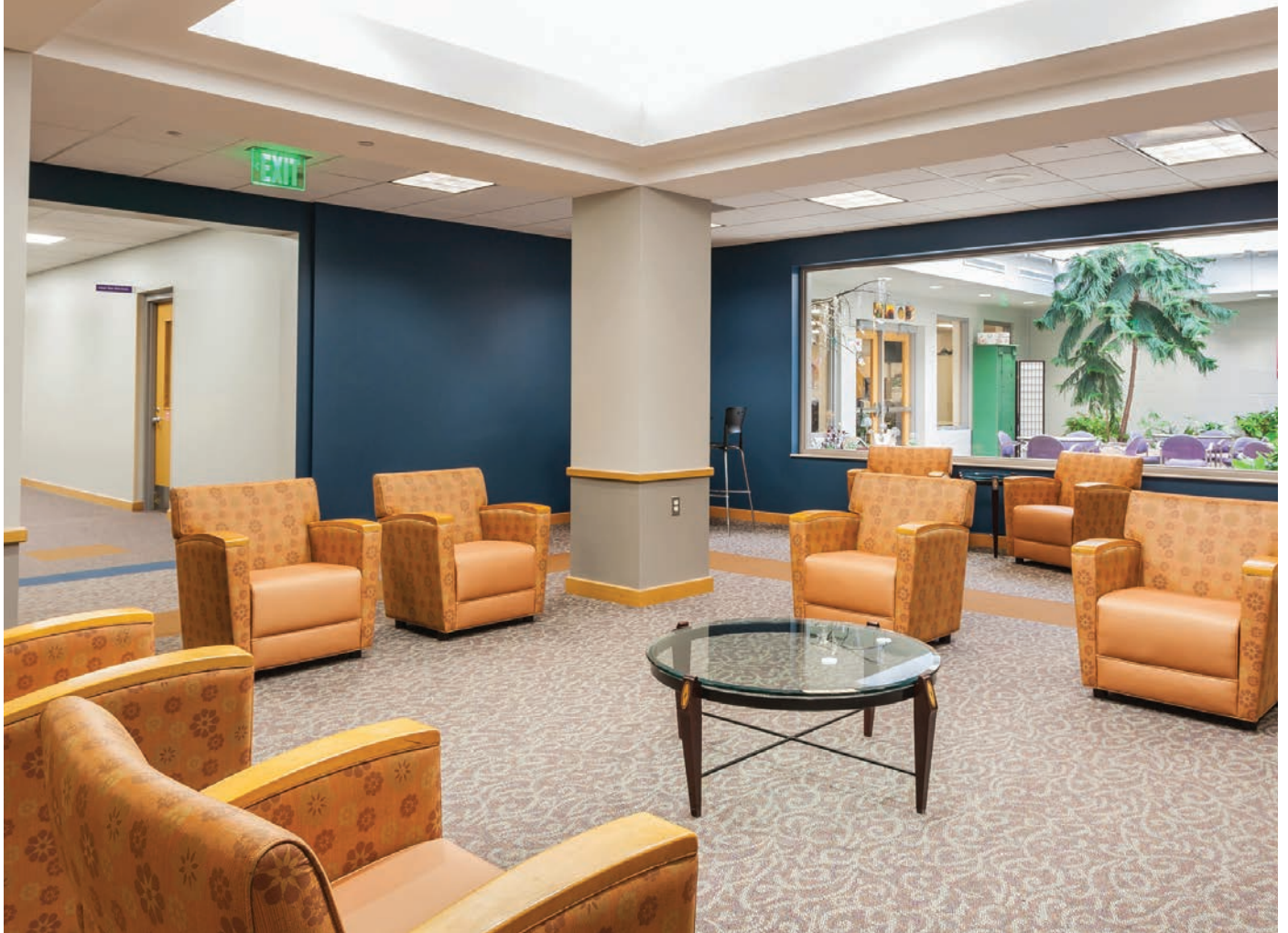
Older Persons' Commission, Rochester, Michigan—lobby