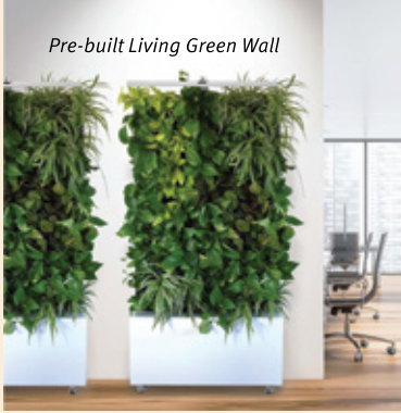
Pre-built Living Green Wall